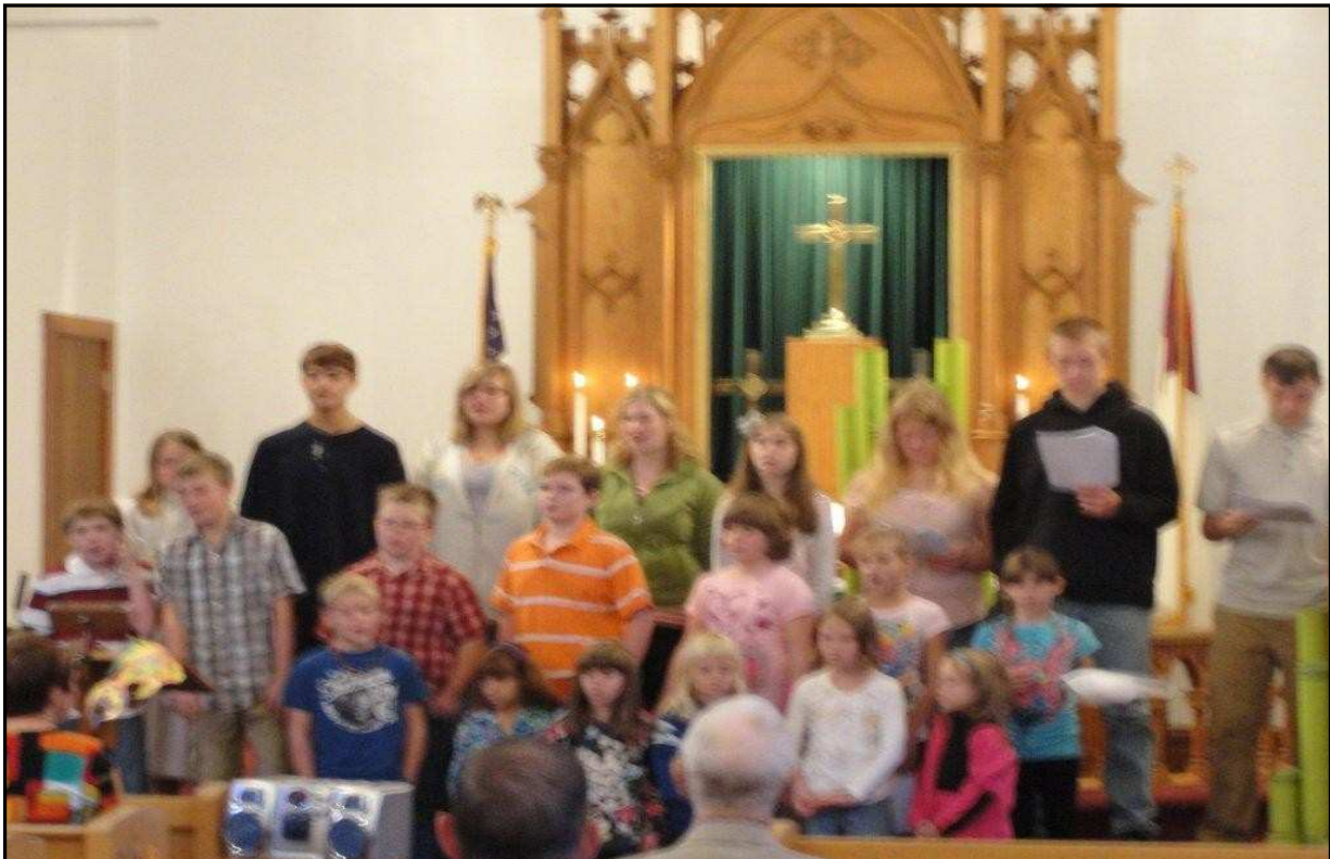
Trinity Sunday School, 2011—2012